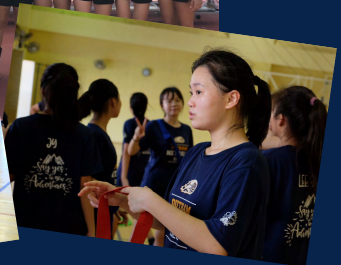
Enqi's daring endeavours and successes at Netball