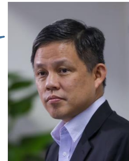
Chan Chun Sing Minister for Education